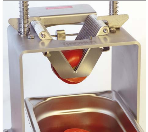
Slicer 5,5 mm for tomatoes and citrus fruits