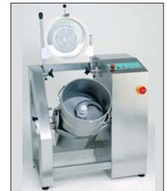
CutStar 40liter with two speed settings or variable

Cutter: from the 2liter / one speed model to our professional 40liter cutter.