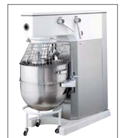
Planetary mixer 60liter with 60liter bowl

Planetary mixer from 5liter to 80liter model with heating capacity, scrapers, rollers etc.