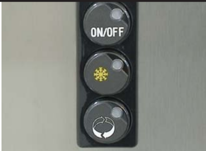
The granita pulse switch (below).