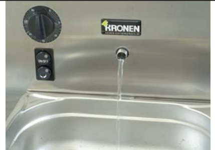
For quick and easy cleaning: the rinsing device .

The temperature holding switch keeps your icecream at serving temperature. The machine automatically starts cooling again if the temperature drops and the icecream starts to melt. Keeps your icecream at perfect serving temperature. A real advantage of our model G10.