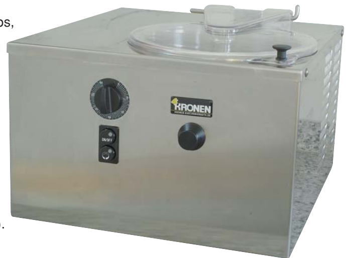
model G 5

Warning lamp for incorrect product temperature (only with model G10)