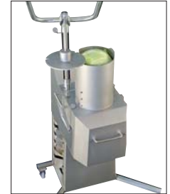
KG-453 the efficient vegetable cutter from Kronen

Vegetable cutter: rating, shredding, grinding. From table top model to freestanding unit.