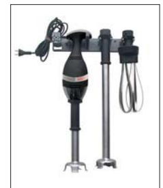
Bermixer B3000 for blending fruit, whisking creams and icecreams ... and many more!

For mixing and blending. From 4liter tabletop model via hand-held mixer to turbo mixing unit.