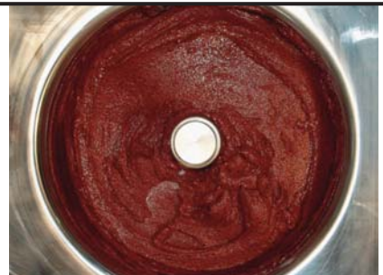
Blueberry Sorbet .... and many more!