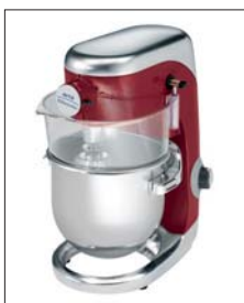
Ditomix 5 compact model with 5liter bowl

Planetary mixer from 5liter to 80liter model with heating capacity, scrapers, rollers etc.