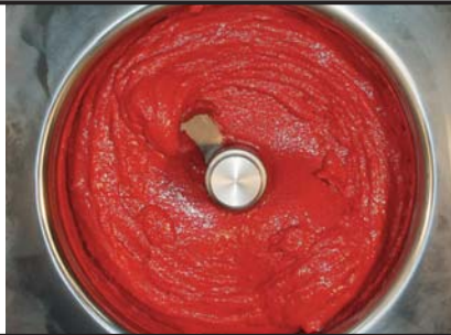
Red Berries Sorbet