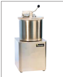
Nako Cutter 5liter The Kronen cutter with pulse switch

Cutter: from the 2liter / one speed model to our professional 40liter cutter.