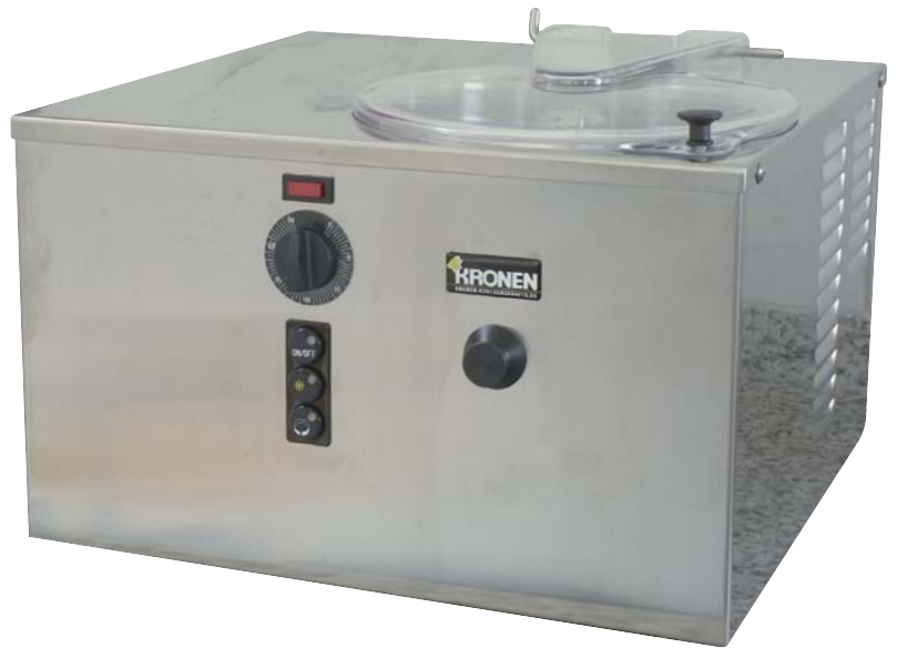
model G 10

For truly stunning desserts: these machines let you produce home-made icecreams, sorbets and granita.