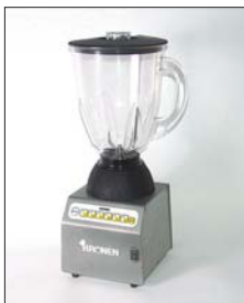
KM-4 New commercial blender from Kronen

For mixing and blending. From 4liter tabletop model via hand-held mixer to turbo mixing unit.