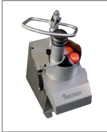
KG-201 the new vegetable cutter from Kronen

More appliances for bakery, patisserie, restaurant and bar.