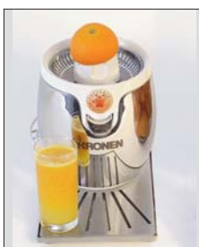
KP-3 the smallest of the Kronen citrus presses

For freshly pressed juice. From hand-operated model to fully automatic.